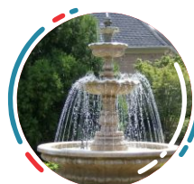
Gardens and Fountains