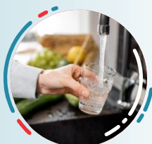
Domestic Water Supply