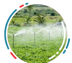
Drip and Sprinkler Irrigation