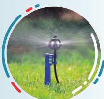
Sprinkler and Drip Irrigation