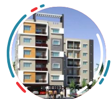
Buildings and Hotels