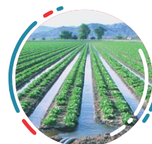
Agriculture Water Supply