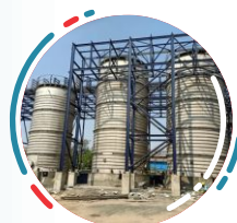
Civil and Industries